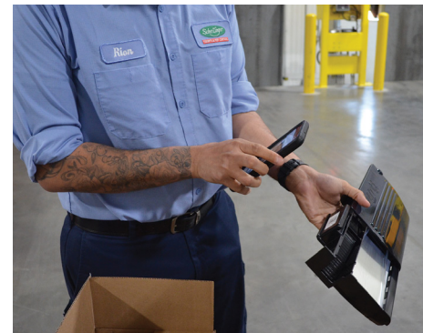
Above: A ScherZinger technician is setting up a 24/7 iQ device.