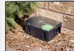
EXTERIOR OF HOMES

Must adhere to the USE RESTRICTIONS in the DIRECTIONS FOR USE section of this label.