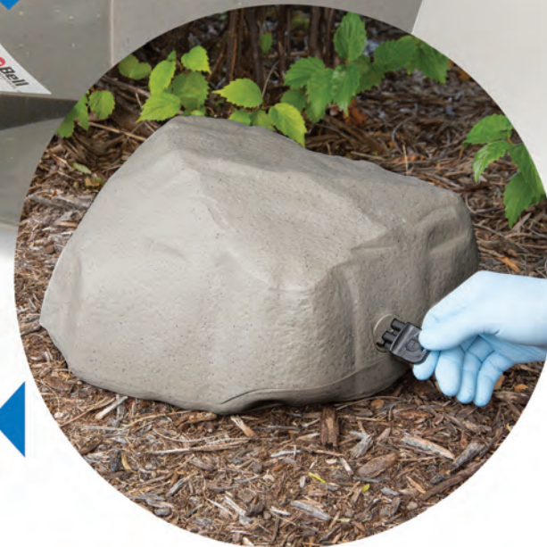
Single-locking mechanism with EVO key