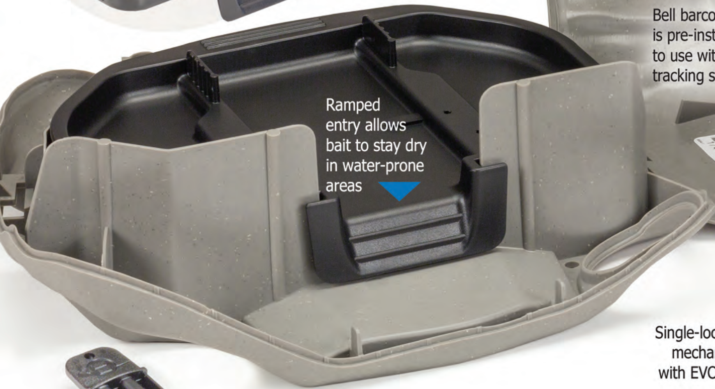
Ramped entry allows bait to stay dry in water-prone areas