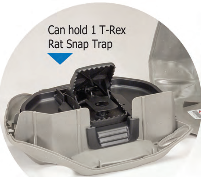
Can hold 1 T-Rex Rat Snap Trap

NEW FEATURES TO MAKE SERVICING FAST AND EASY