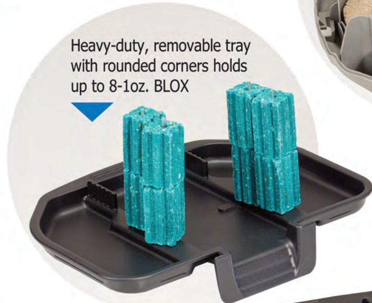
Heavy-duty, removable tray with rounded corners holds up to 8-1oz. BLOX