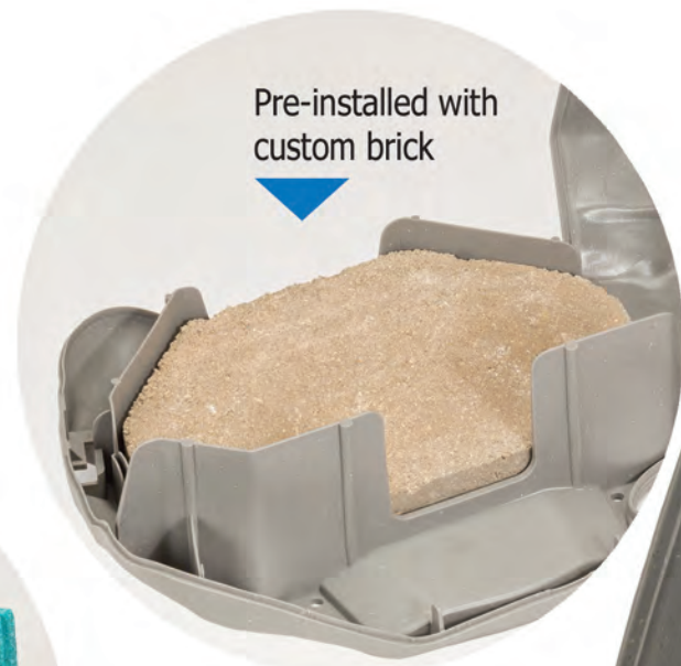
Pre-installed with custom brick