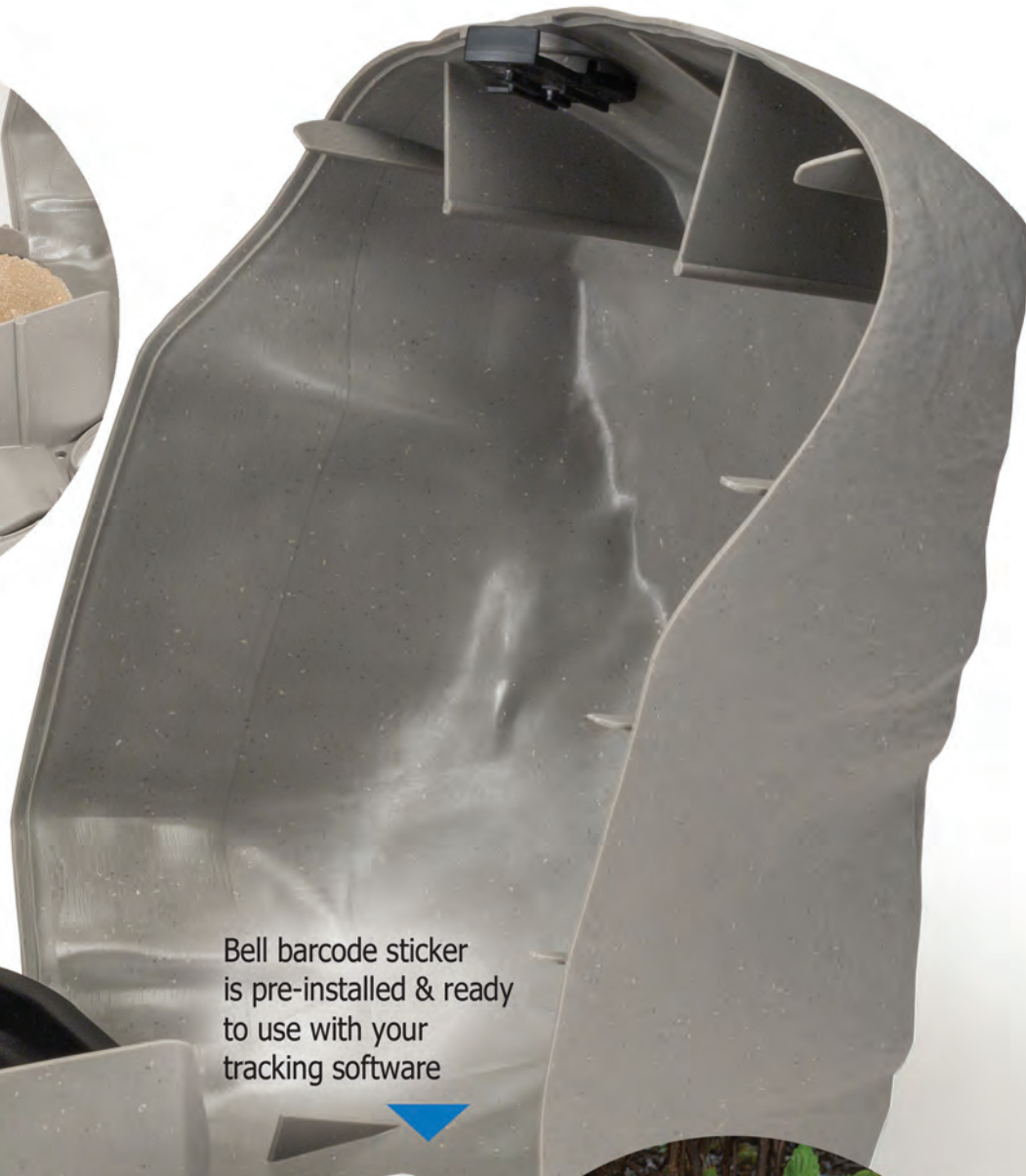
Bell barcode sticker is pre-installed & ready to use with your tracking software